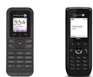
8232 DECT 8168s WLAN